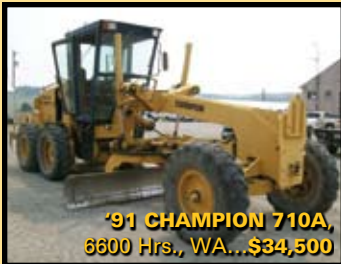
'91 CHAMPION 710A, 6600 Hrs., WA...$34,500