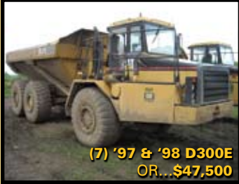
(7) '97 & '98 D300E OR...$47,500