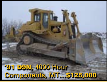
'91 D9N, 4000 Hour Components, MT...$125,000