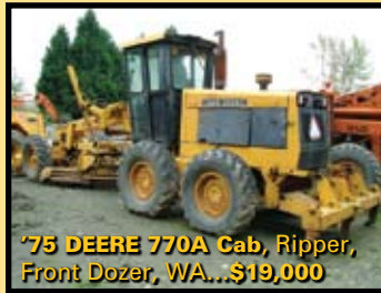
'75 DEERE 770A Cab, Ripper, Front Dozer, WA...$19,000