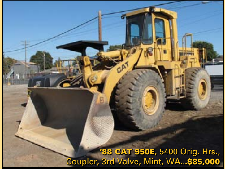
'88 CAT 950E, 5400 Orig. Hrs., Coupler, 3rd Valve, Mint, WA...$85,000