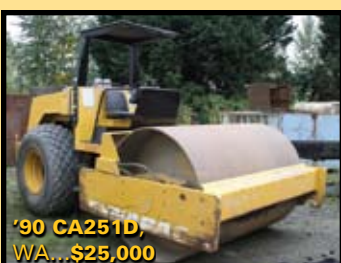
'90 CA251D, WA...$25,000