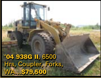
'04 938G II, 6500 Hrs, Coupler, Forks, WA...$79,500