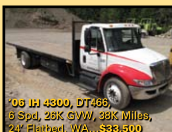
'06 IH 4300, DT466, 6 Spd, 26K GVW, 38K Miles, 24' Flatbed, WA...$33,500