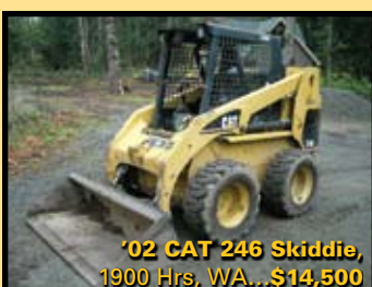
'02 CAT 246 Skiddie, 1900 Hrs, WA...$14,500