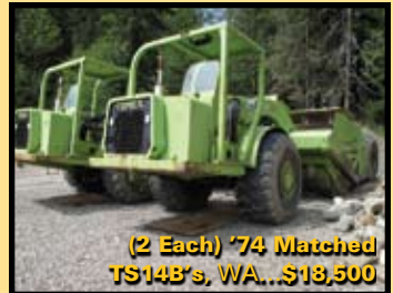
(2 Each) '74 Matched TS148's, WA...$18,500