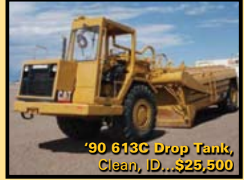
'90 613C Drop Tank, Clean, ID...$25,500