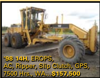
'98 14H, EROPS, AC, Ripper, Slip Clutch, GPS, 7500 Hrs., WA...$157,500