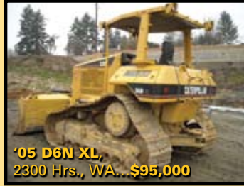
'05 D6N XL, 2300 Hrs., WA...$95,000