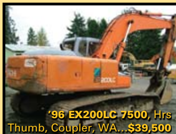
'96 EX200LC 7500, Hrs Thumb, Coupler, WA...$39,500