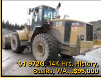
'01 972G, 14K Hrs, History, Scales, WA...$95,000