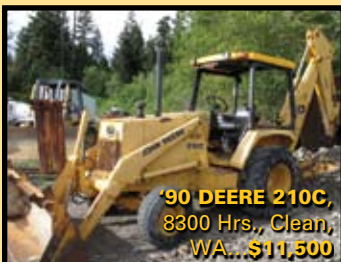
'90 DEERE 210C, 8300 Hrs., Clean, WA...$11,500