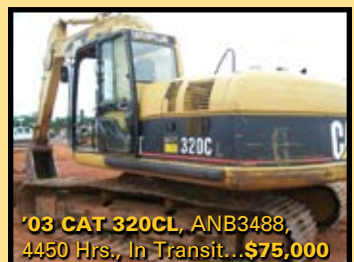
'03 CAT 320CL, ANB3488, 4450 Hrs., In Transit...$75,000