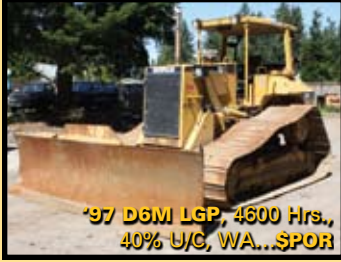
'97 D6M LGP, 4600 Hrs., 40% U/C, WA...$POR